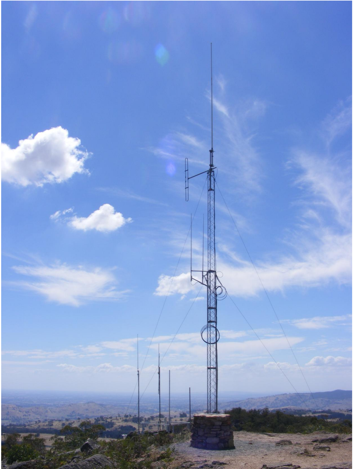
Another photo of the Mt Wombat coverage area.