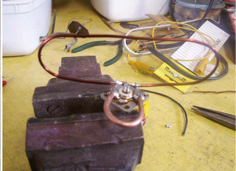
Make the driven element out of N connector, 2 mm copper wire and a RG-402 half wave 4:1 balun.