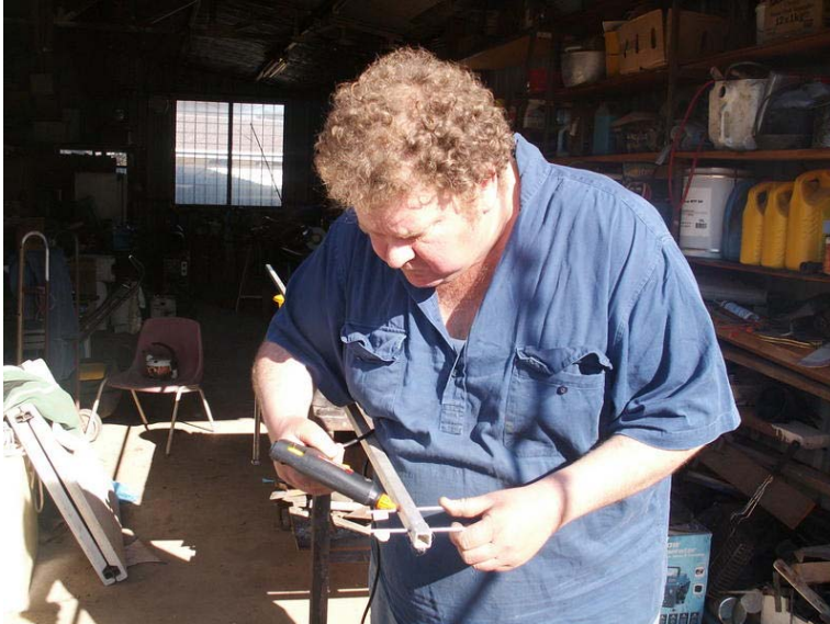
Hot melt glue the elements into place against boom.