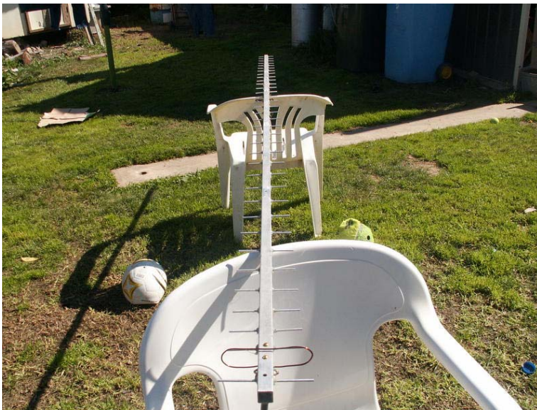
The finished 1296 Mhz 36 element beam. And it works to. Dinki Di!

Some Links to help with Measurements and design.