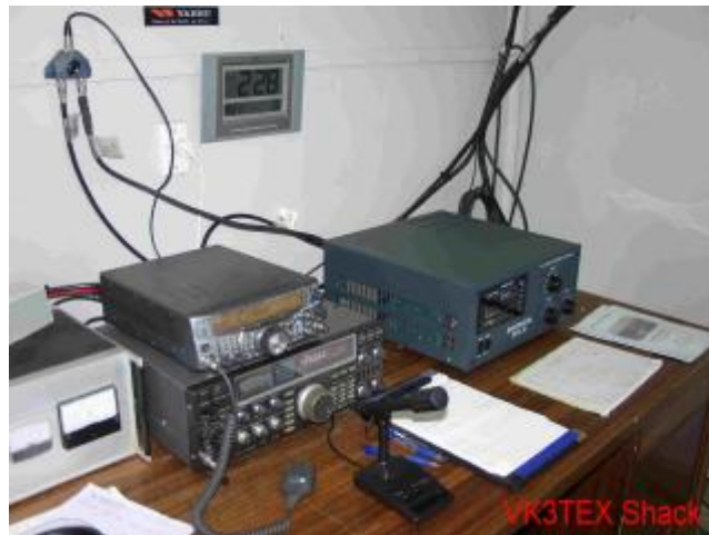
Inside the shack